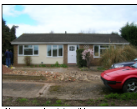
Above: completed demolition

The last two years have seen the UK property market shift from a hot sellers'