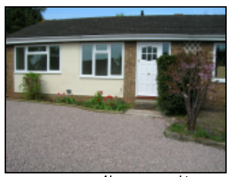
Above: new parking area