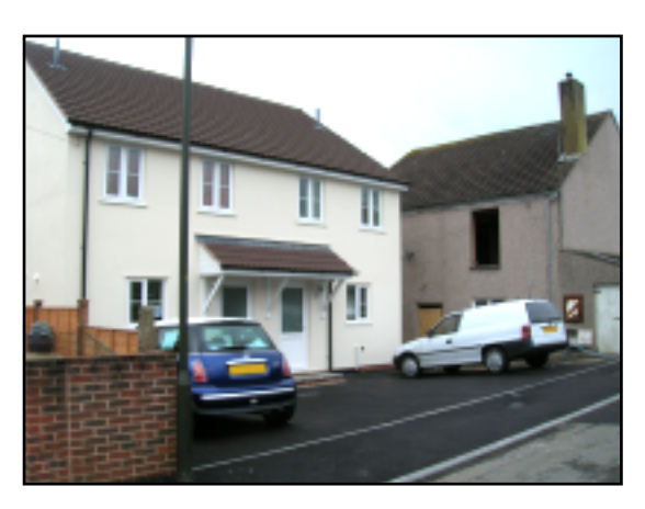
Above: the new semis at Broadwell, with what remains of the original semi on the right

The first sale completed on the 27th of lanuary and the second on the 10th of February. At a time when young buyers often struggle to gain a foothold on the property ladder, we are especially happy to report that the new owners of both of these homes are local young people. The erection of this new building has certainly improved the appearance of the street.