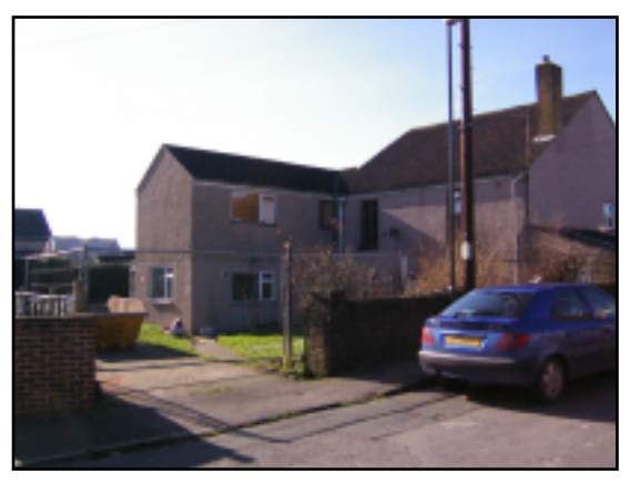
Above: the original semi at Broadwell

Welcome to our spring edition. The past quarter has seen the completion of two sales (the new semis on our Broadwell site) as well as steady progress on our other projects. We have installed kitchen windows in Bishopswood, poured concrete for the ground floor of the original semi at Broadwell, and almost finished our extensive refurbishment programme the Lydney bungalow.