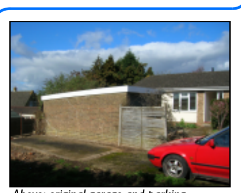
Above: original garage and parking

Once the scruffiest place on the street, this is now a comfortable home set in attractive grounds.