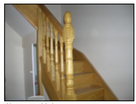
Above: new Idigbo staircase