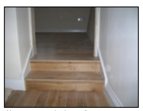
Above: steps to bedroom 2