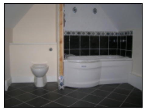
Above: bathroom at Bishopswood