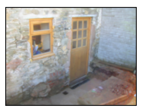
Above: front of house at Broadwell

Choosing them was a most enjoyable task. In view of what they will add to the property, we decided that it was