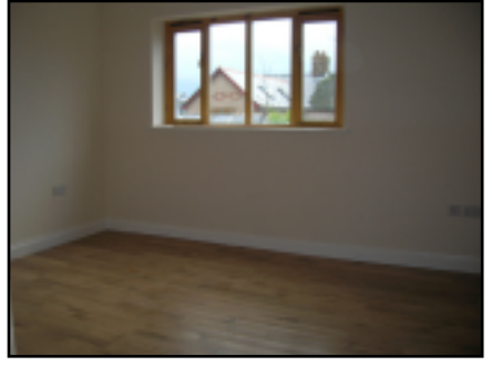
Above: bedroom 2

The area in front of the cottage has received some attention too. We hired a groundwork contractor to remove and crush the final bits of the old lean-to shed: a thick slab of concrete and the last section of wall.