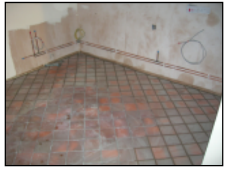
Above: kitchen tiles going down

We are currently tiling the hallway, kitchen and utility room with six-inch brown quarry tiles, and will install the kitchen shortly.