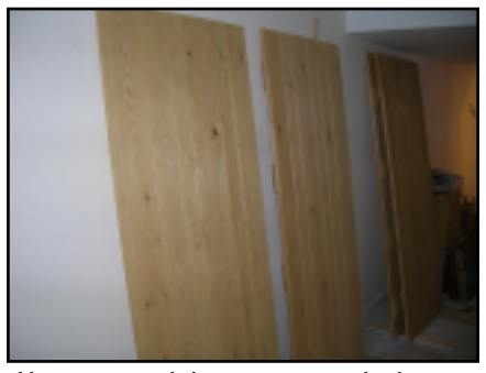
Above: internal doors waiting to be hung