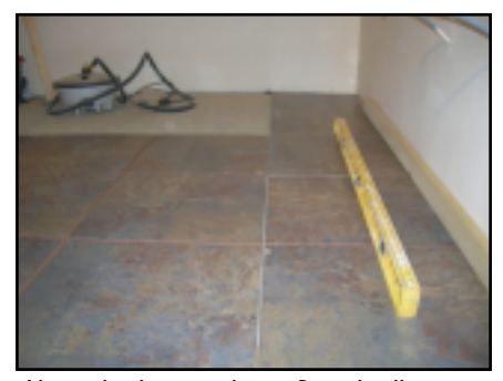
Above: bathroom tiles at Broadwell