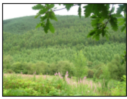
Above: north view in Wales

Preparing to launch this project is proving to be something of a marathon.