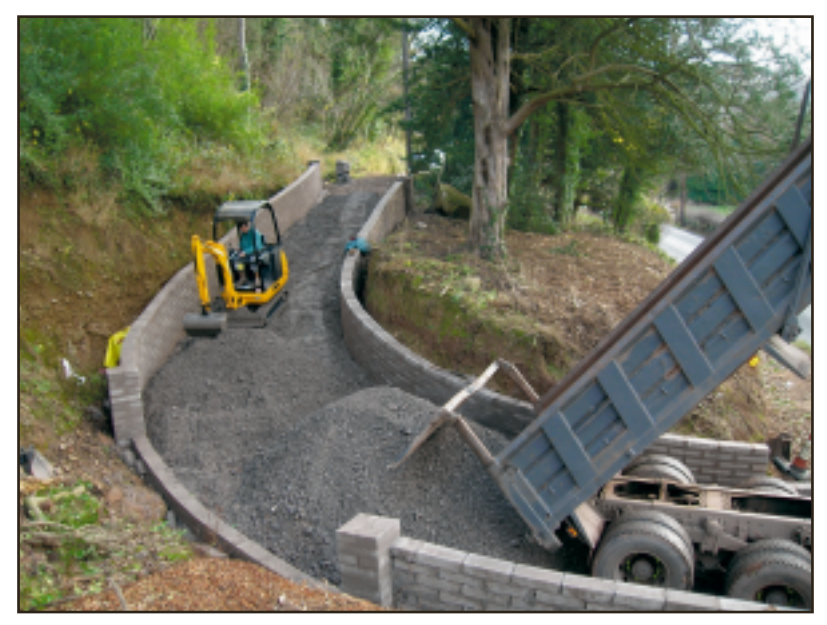
Work continues in Bishopswood

The photo below shows the driveway leading to our Victorian cottage in Bishopswood. Our work on this picturesque old property is nearly completed, and we can find tenants for it very soon. We feel that it makes more sense to keep and rent this little gem than to sell it in today's market.