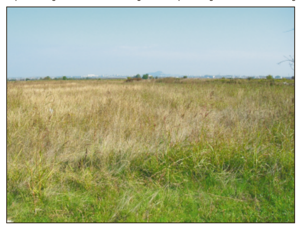
Our land near Plovdiv, Bulgaria

The local Council is considering our application for re-zoning. As our autumn newsletter explained in greater detail, we've bought a level plot of agricultural land measuring