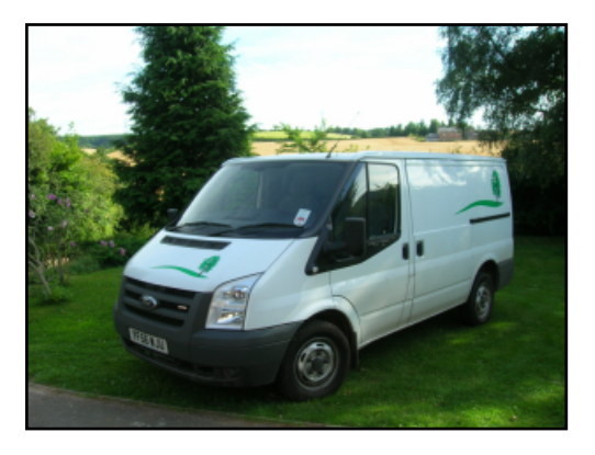
Our Biodiesel-powered Transit Van

We've recently started producing biodiesel from waste cooking oil that we've collected from local businesses. This fuel is fully compatible with most diesel engines. We're testing the fuel in our Ford Transit van and other diesel-powered vehicles with a view to using it exclusively. This will reduce our vehicles' carbon emissions, extend their operational lives and help us save money.