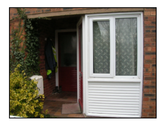
The Blakeney Property