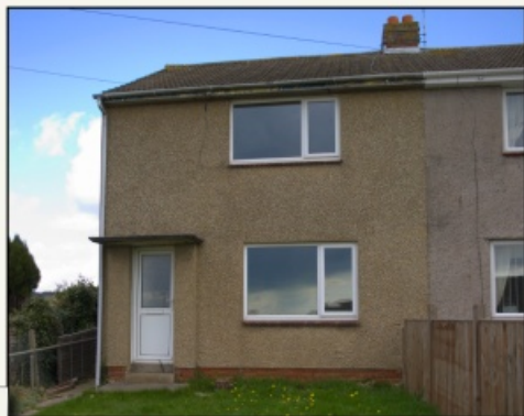
A property with potential...

It's very satisfying to see new life being breathed into this building which has had minimal attention for a number of years. It won't be long now before we can down tools and advertise it on the rental market.