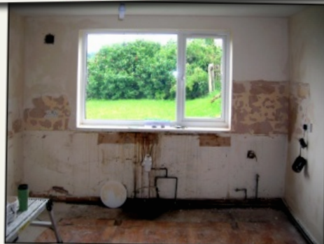
Kitchen under refurbishment.