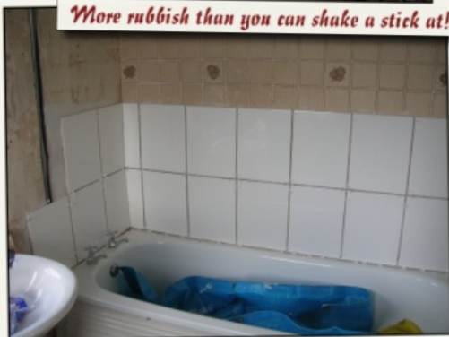
Bathroom under refurbishment.