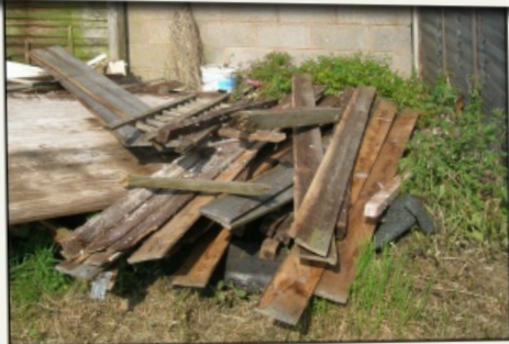
... which we have knocked down.