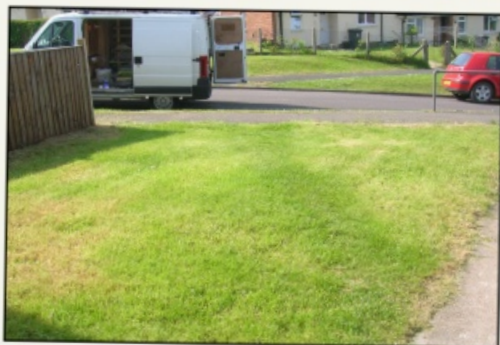
... a decent lawn...