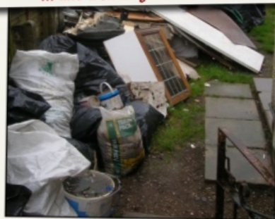
More rubbish than you can shake a stick at!