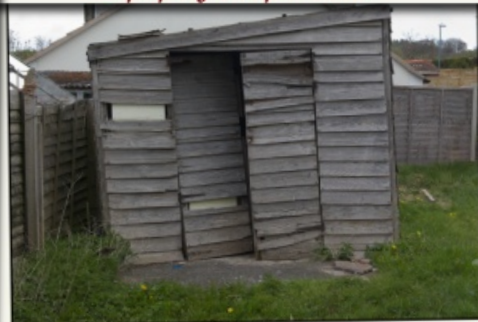
... and a rickety shed...