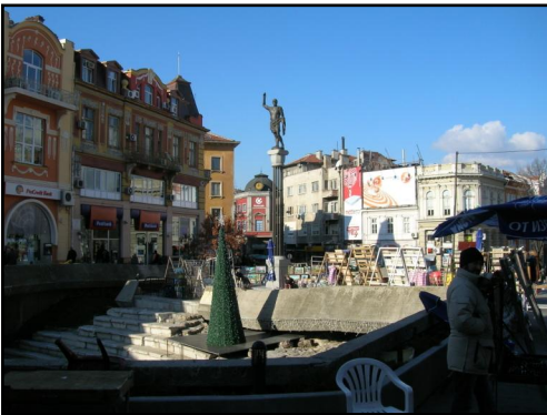
Above: Philip II of Macedon in Plovdiv

Investing in rental property is like planting an apple tree. For the first few years you may not see much increase in fruit, but it will build up as the years go by. After 10-15 years your property will be producing nicely and will probably have doubled in value. You might consider buying 2 or more properties and using the increased value over time to pay off